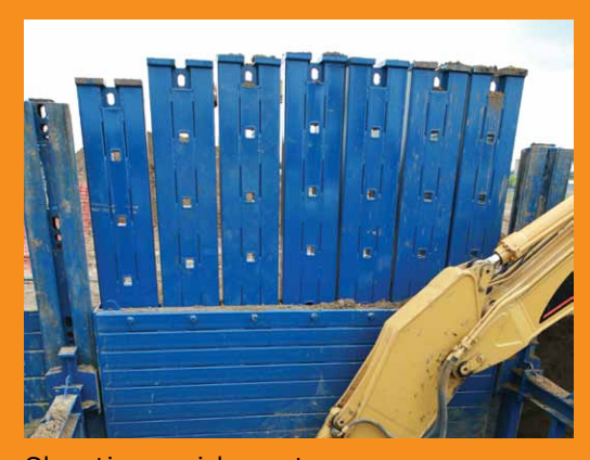
Sheeting guide system